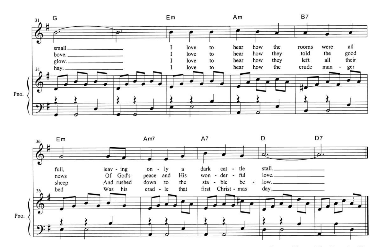
Repeat Chorus After Verse 4 to Fine