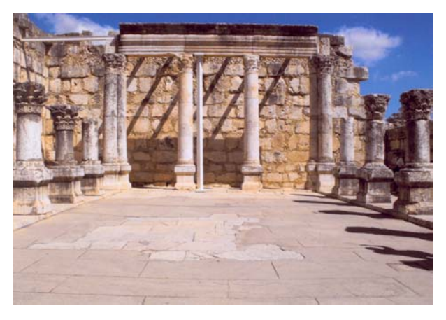
Ruins of Synagogue

Discussion: Agree/disagree: Is it important for archeologists to find things dealing with biblical truth? Why or why not?